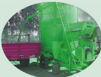
Outlet hopper helps to transfer grains from dryer to trailer.