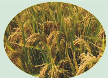
Paddy crop in field