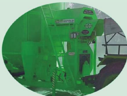
High Power and efficient waste separator from grains.